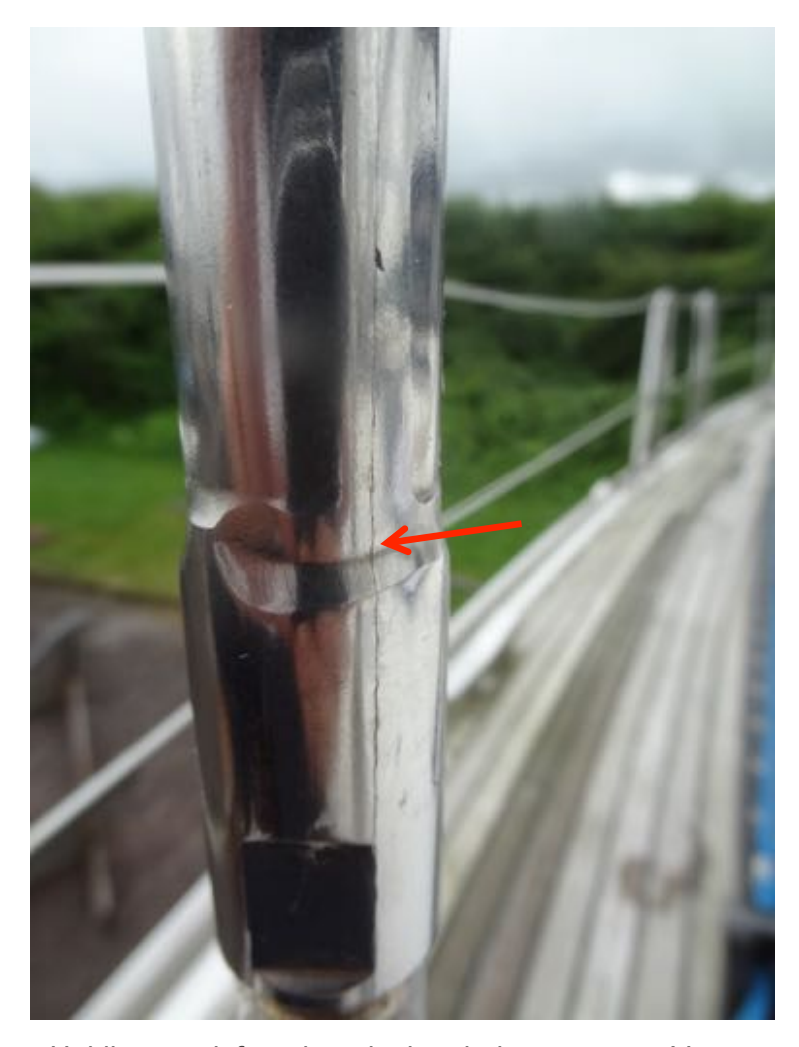
Hairline crack found on rigging during a survey. Very faint and difficult to see, but significant.