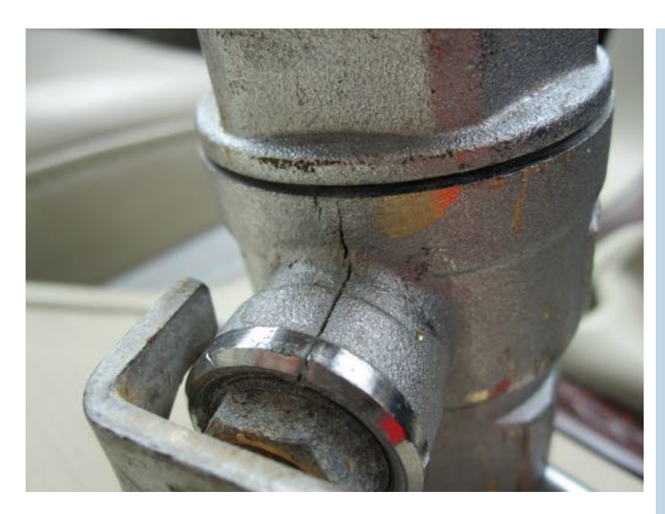
Crack found in the body of a seacock valve.